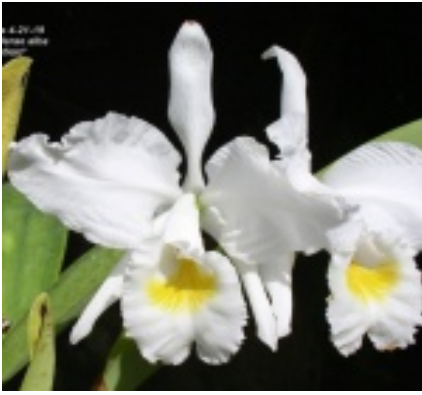
C. schroederiae alba 'Rehfield'

$250 5" pot, 5 mature growths and one new lead