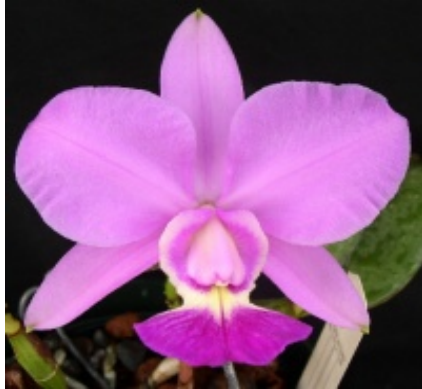
C. walkeriana 'The Chairman' AM/AOS