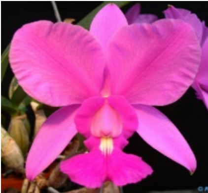
C. walkeriana 'Welcome Back' 81 pts, 2015